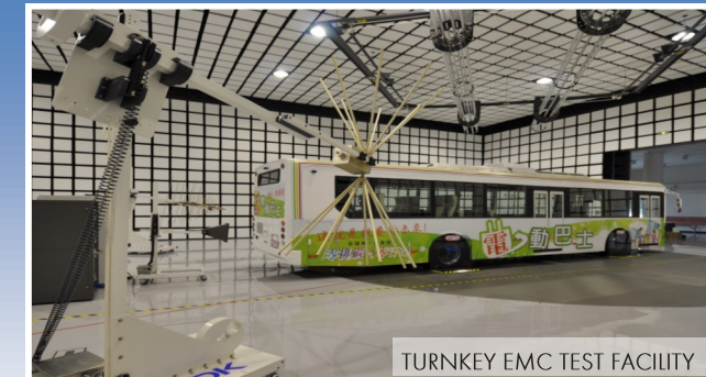
TURNKEY EMC TEST FACILITY

8:30 AM – 1:30 PM ▲ iNARTE Certification Exam Chesapeake I