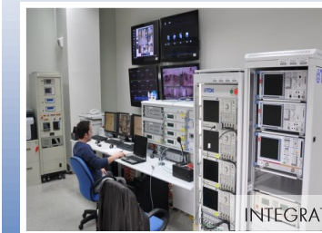
INTEGRATED TEST SYSTEM