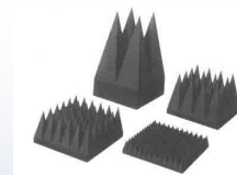
CLOSED CELL ABSORBER