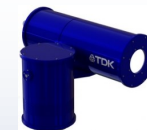
RF SHIELDED CAMERA

Your ideal source for total EMC solutions